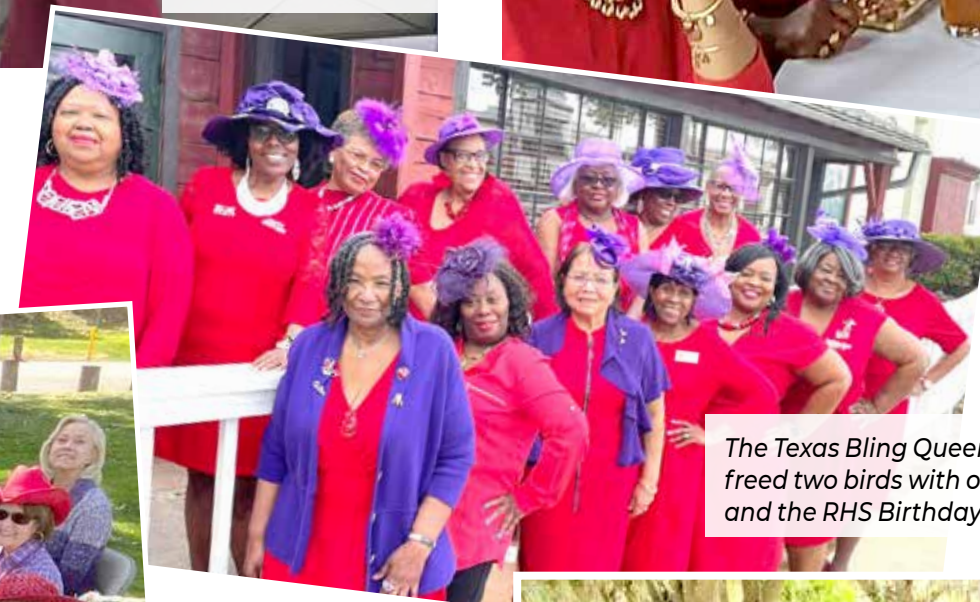
The Texas Bling Queen's Council from Texas, USA freed two birds with one key by celebrating Easter and the RHS Birthday all in one day!