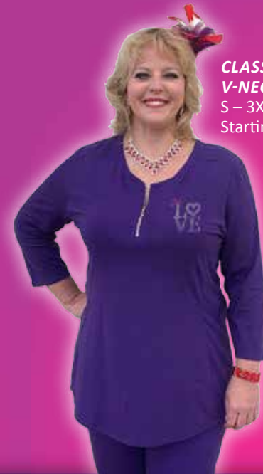
CLASSIC ZIPPER V-NECK TUNIC S - 3X Starting at $34.99