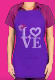
APRON One size fits most $19.99