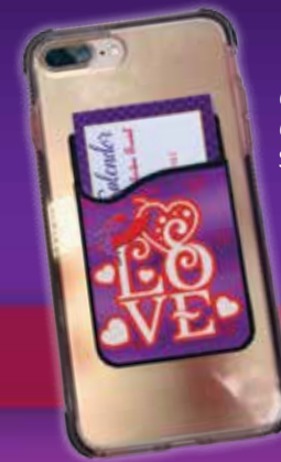
CELL PHONE CADDY $5.99