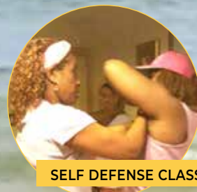
SELF DEFENSE CLASS