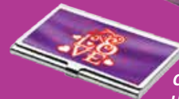
CALLING CARD HOLDER $12.99