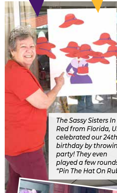
The Sassy Sisters In Red from Florida, USA celebrated our 24th birthday by throwing a party! They even played a few rounds of "Pin The Hat On Ruby!"