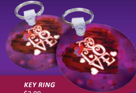
KEY RING $3.99