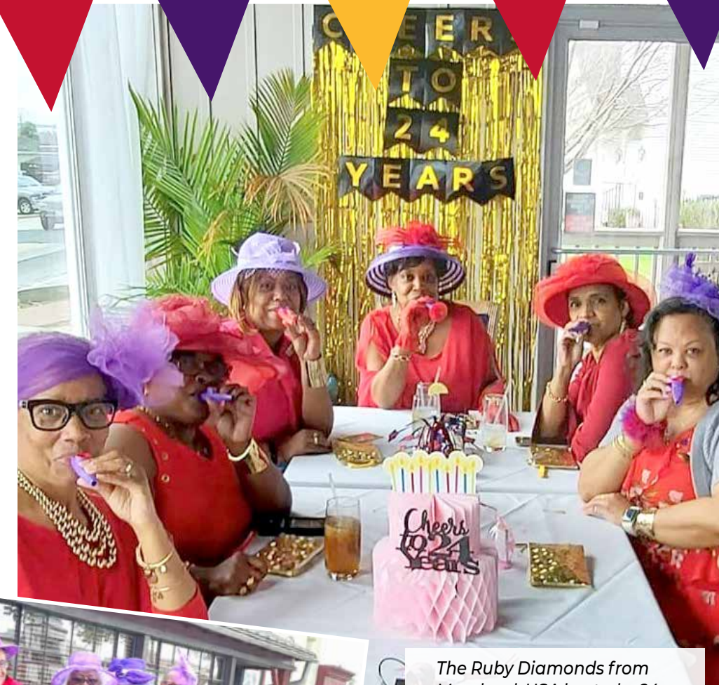
The Ruby Diamonds from Maryland, USA hosted a 24 Carat Gold Luncheon in honor of our birthday celebrations. They even performed songs on the Kazoo!