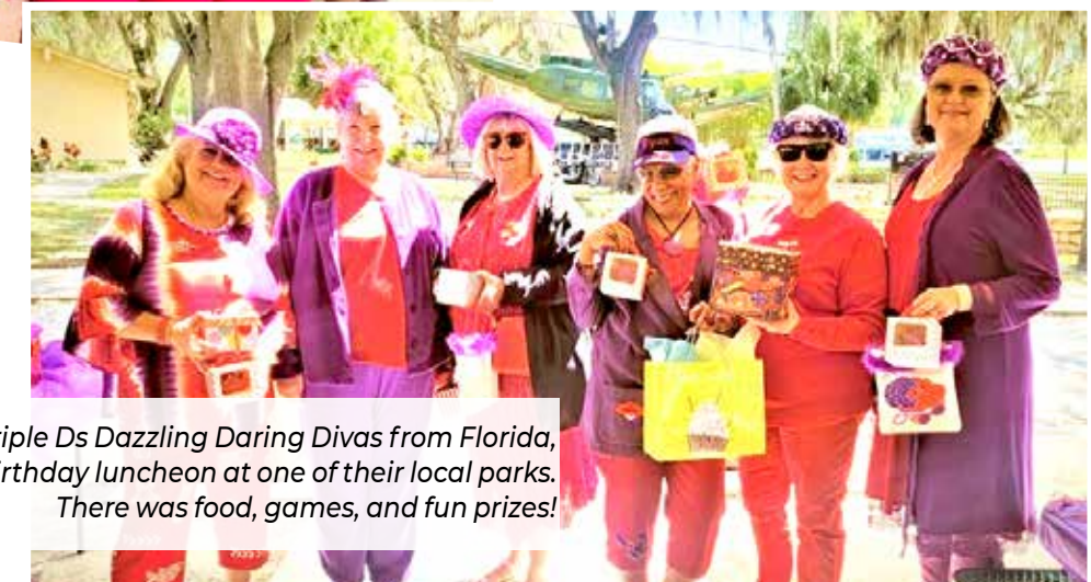
The Tampa's Triple Ds Dazzling Daring Divas from Florida, USA hosted a birthday luncheon at one of their local parks. There was food, games, and fun prizes!