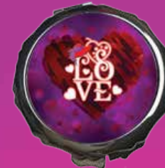
SCALLOP COMPACT DOUBLE MIRROR $9.99