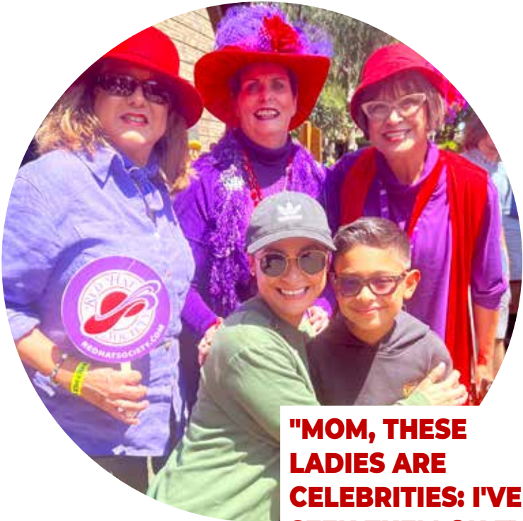
"MOM, THESE LADIES ARE CELEBRITIES: I'VE SEEN THEM ON TV!"

I hope you can join me at these upcoming events I will be attending: