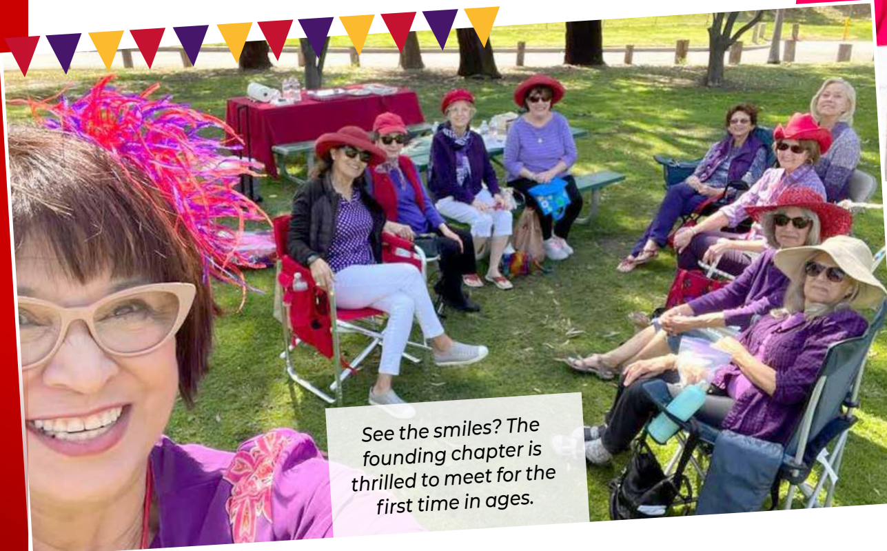
See the smiles? The founding chapter is thrilled to meet for the first time in ages.