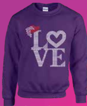
SWEATSHIRT S - 5X Starting at $28.99