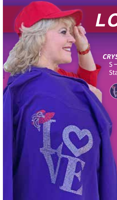
CRYSTAL DENIM JACKET S - 3X Starting at $58.99