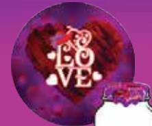
JAR OPENER $3.49